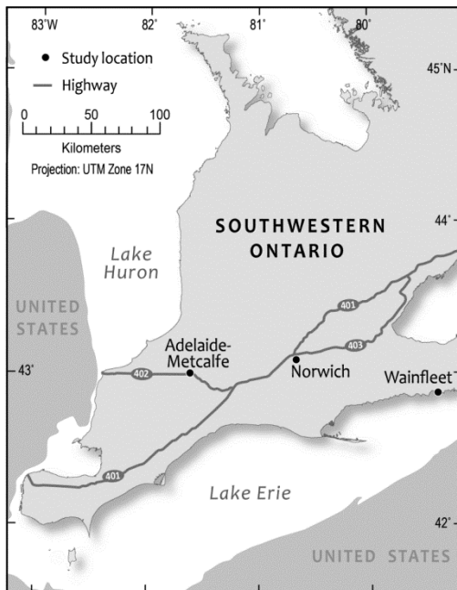
Figure 1.1 - Ontario research communities

In the summer of 2014, a third site located in Oxford County was added to our Ontario sample. Though it was not initially targeted as a potential research site, Norwich (Gunn's Hill Wind Farm) was added because it presented a rare case of community-based wind energy in the Ontario context. This was thought to be a good opportunity to compare an Ontario-based small scale, community wind energy project with similar